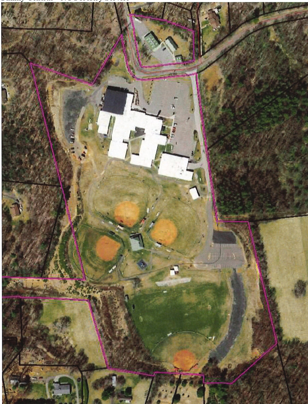
Family Central – NC Forestry Service