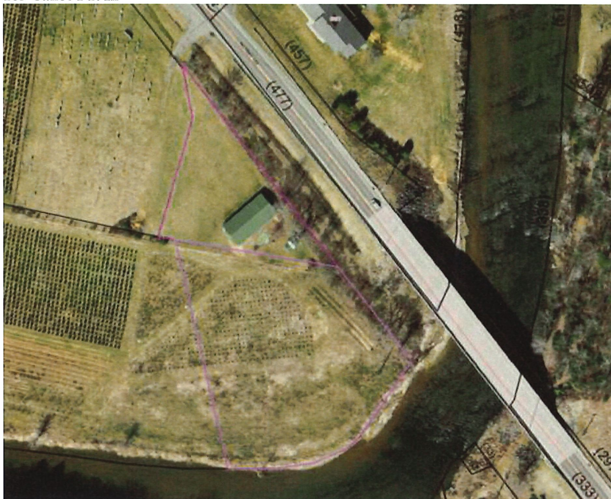
163 Canoe Put In