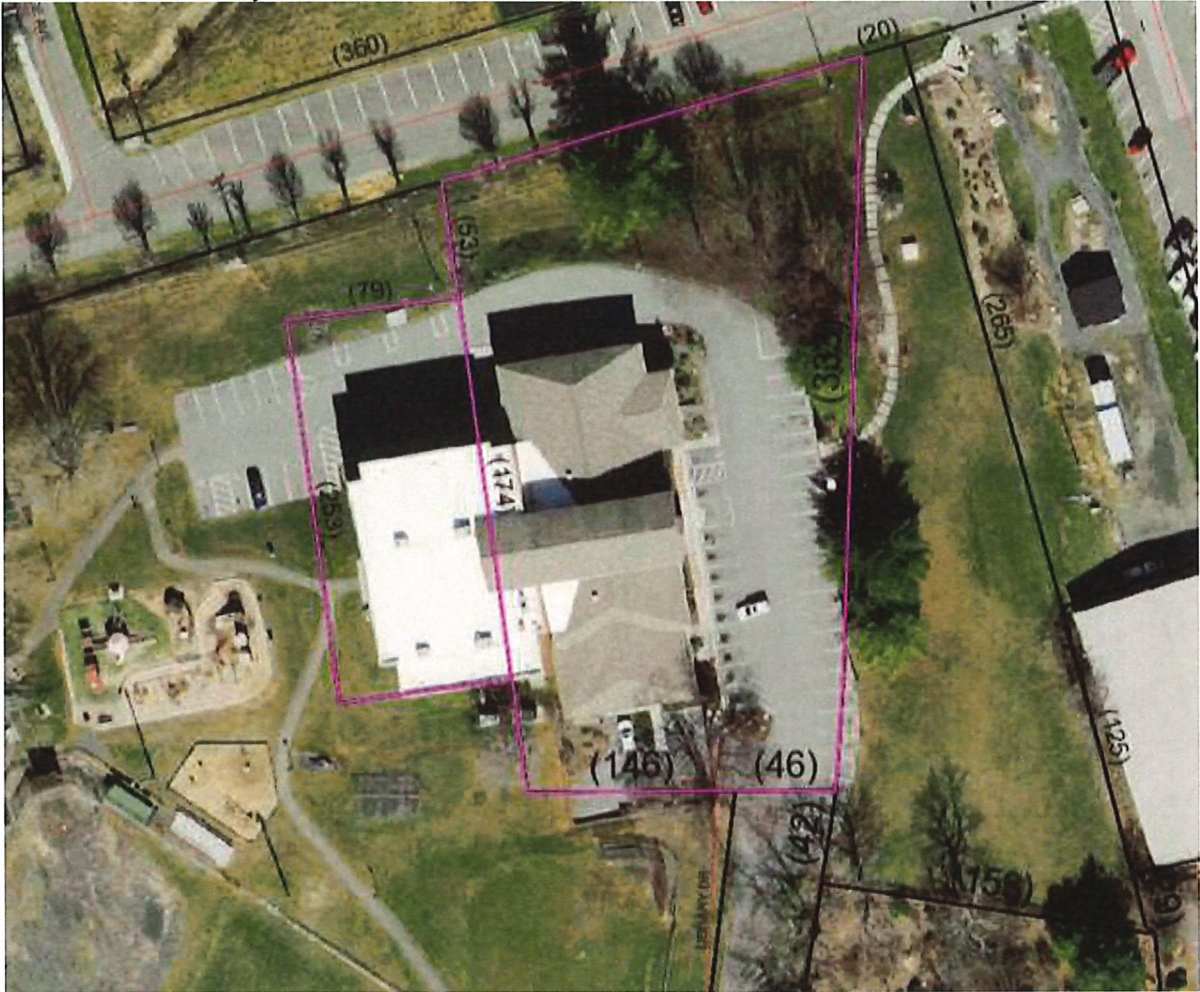
Ashe Count Library